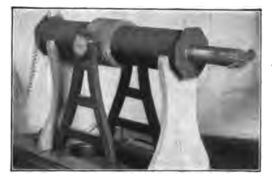
INSTRUMENT TO DEMONSTRATE CAUSE OF EARTH'S ROTATION ON ITS AXIS.

The answer is a startling one. It opens the way to the borderland of one of the great mysteries of our solar system. It brings you face to face with possibilities of stupendous import. It is nothing more nor less than that the earth is a gigantic electric-producing machine. Our world,