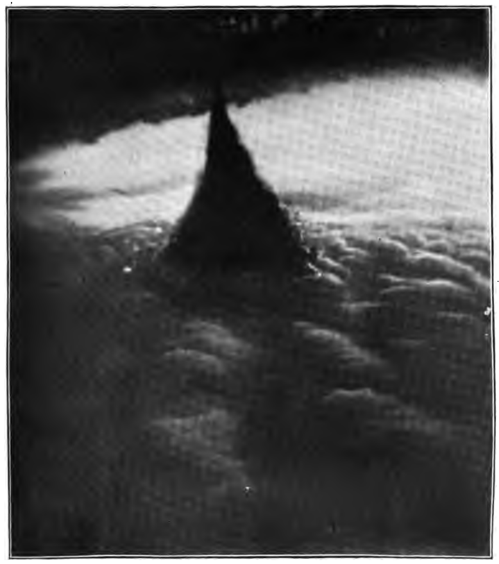
A REAL CYCLONE.

From a photograph in the possession of the United States Weather Bureau-the only one ever taken successfully.