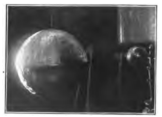
APPARATUS USED TO DEMONSTRATE ELECTRICAL EFFECT OF THE SUNDUPON THE CARTH. Q C

It is a machine that propels itself through the air and returns safely with the self-