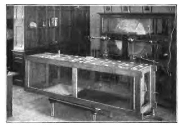
GLASS BOX USED TO DEMONSTRATE THAT MOISTURE FLOWS FROM THE POSITIVE TO THE NEGATIVE POLE.

Simply this: It shows that when an expansible body is electrified it spreads out and becomes less dense. Now, that is precisely what takes place when a quantity of air is charged with electricity. It becomes lighter, its pressure is reduced; and this is directly proved by placing an open bulb in the centre of the cotton ball and collecting the electrified air, which, upon measurement, is found to be appreciably lighter than the surrounding air of the room. When, therefore, a mass of air over any particular region of the world becomes charged with atmospheric electricity its density is diminished, its pressure grows less, and the result is that the barometer goes down.