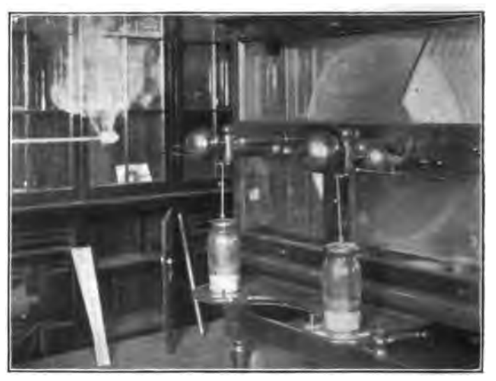
SMOKE FROM BURNING CAMPHOR, ON END OF GLASS TUBE, ASCENDS WHEN ELECTRIC MACHINE IS NOT IN OPERATION.

"Perhaps you know," continues the scientist, "that a current of air is continually streaming from any sharp point charged with electricity. Now, it is not